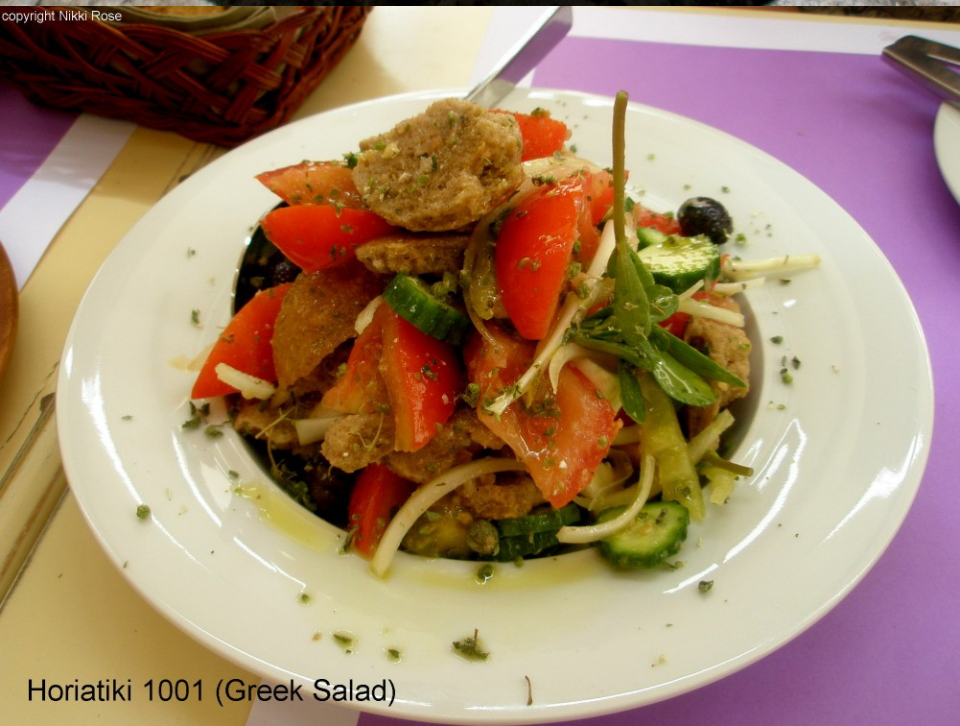
Horiati 1001 (Greek Salad)