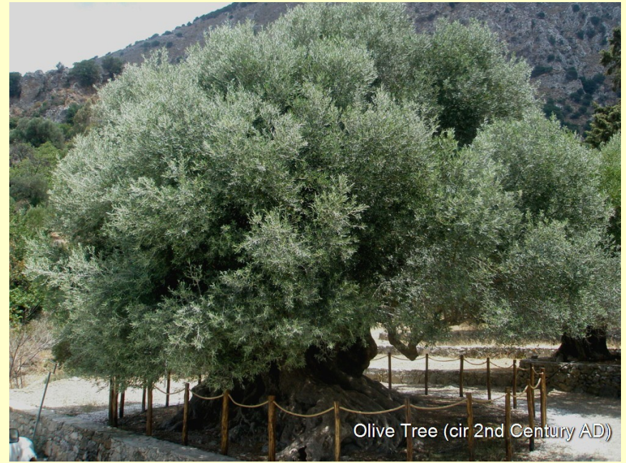
Olive Tree (cir 2nd Century AD)