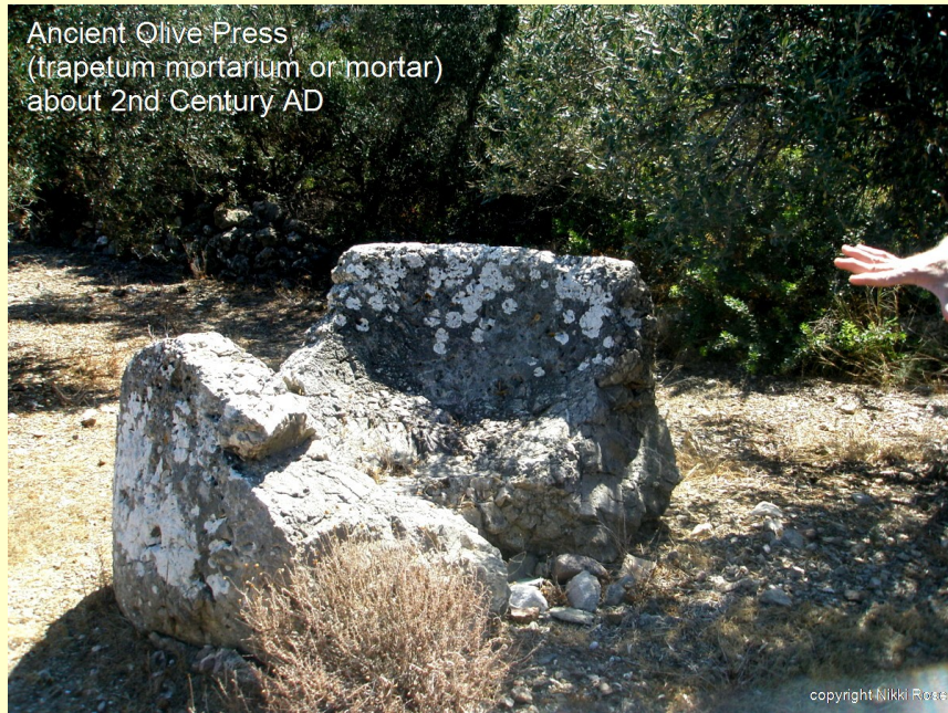
Ancient Olive Press (trapezium mortarium or mortar) about 2nd Century AD