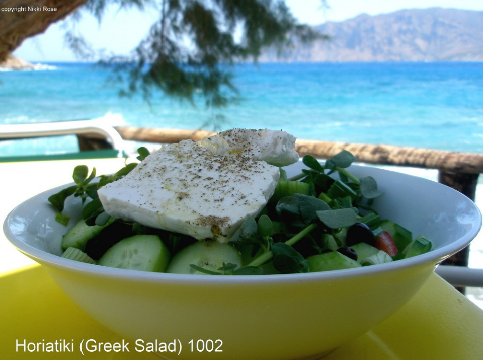
Horiati (Greek Salad) 1002