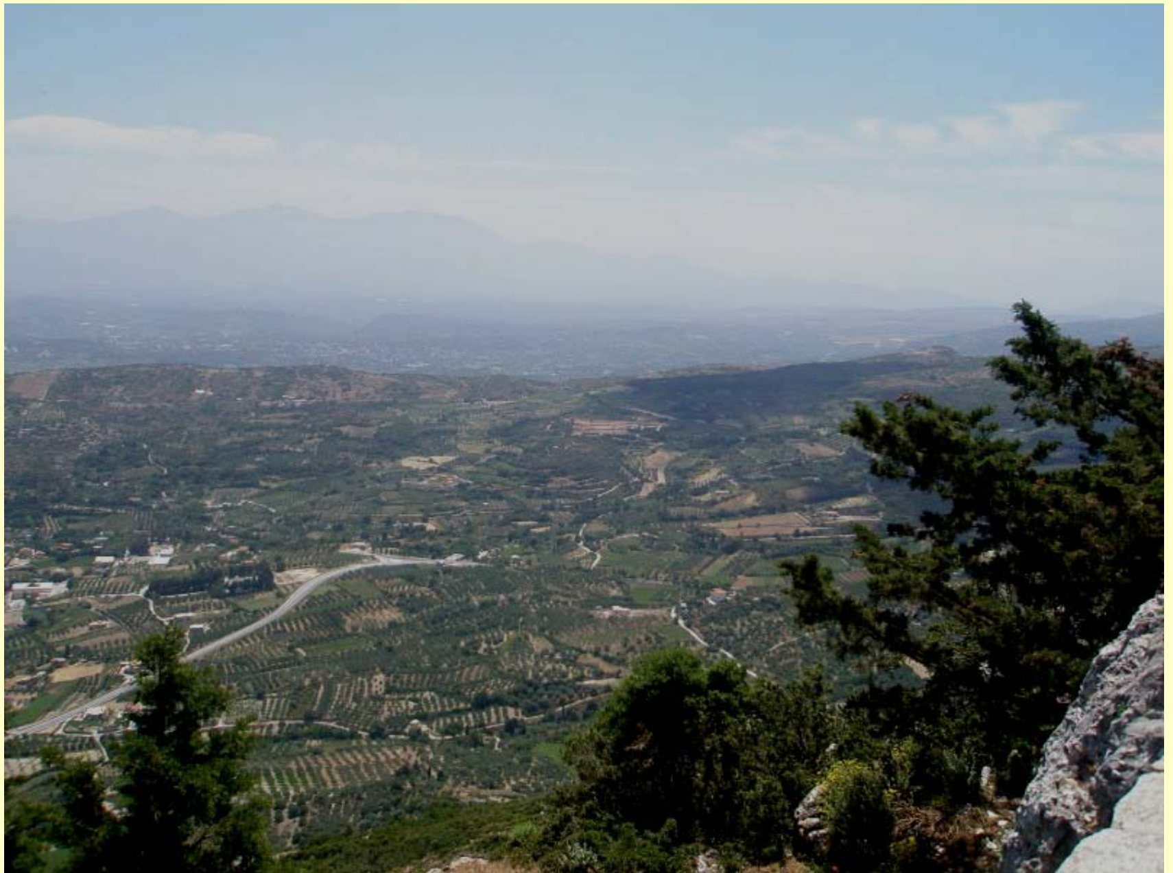
Botanical Hike above Heraklion