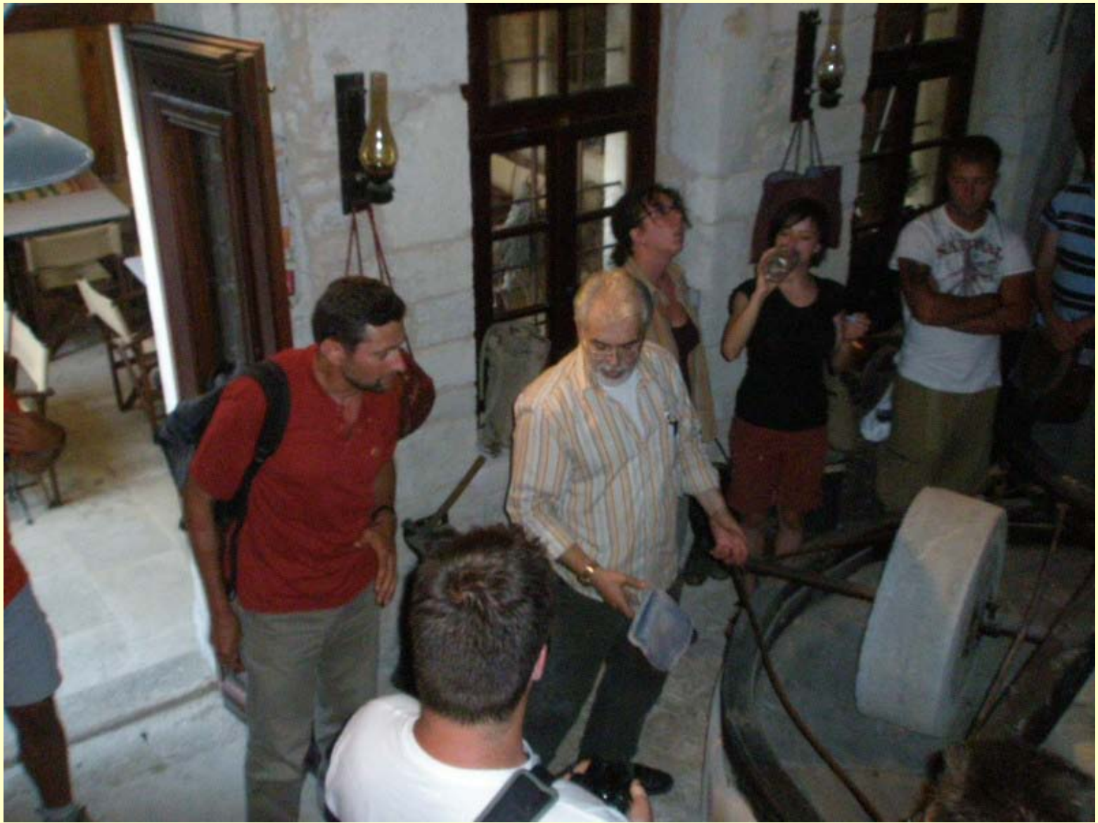
Fabrika Eleni, Venetian-Era Olive Oil Factory-Museum