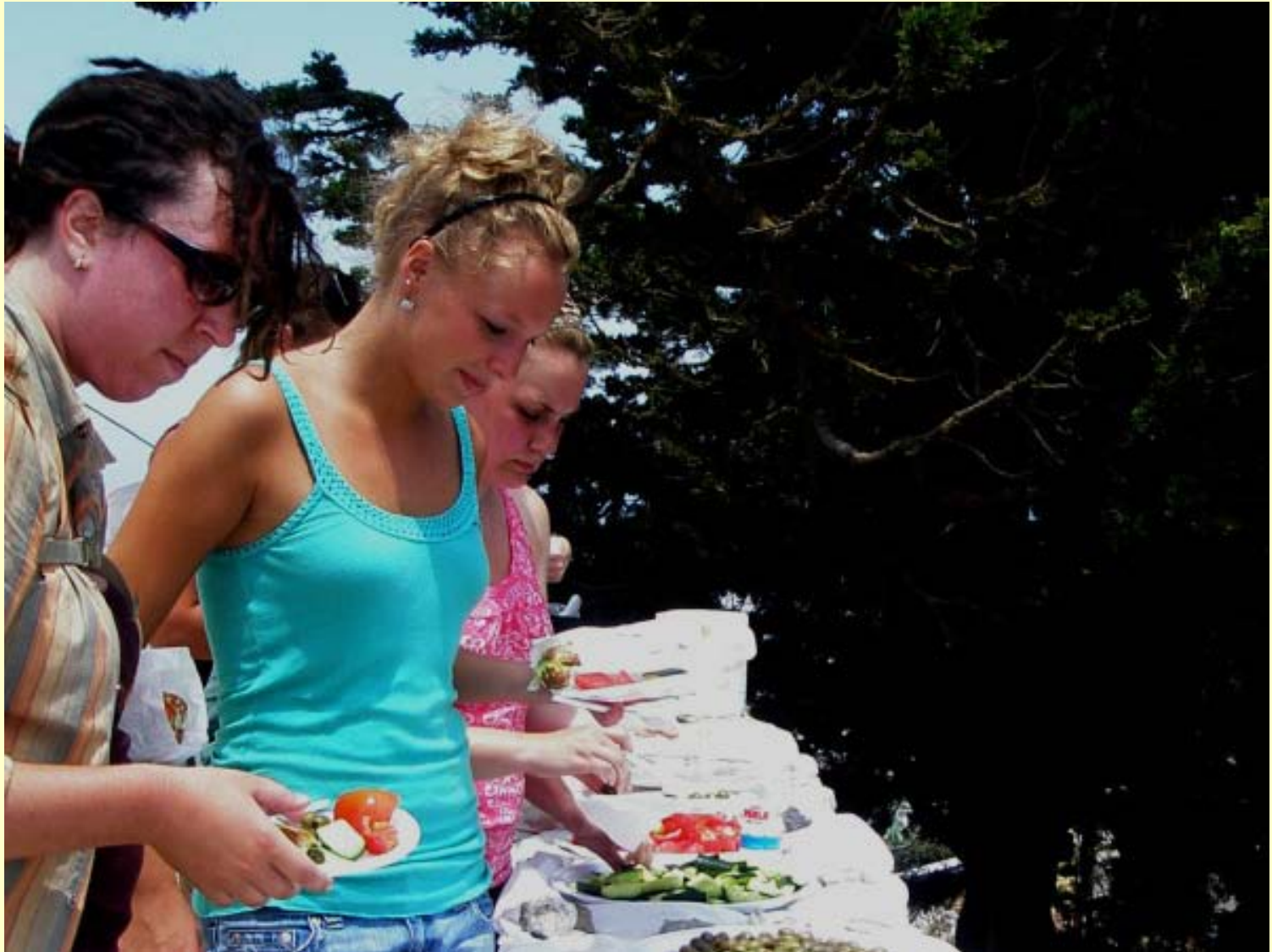
Meze on the Mountain, June 2009 Study Tour