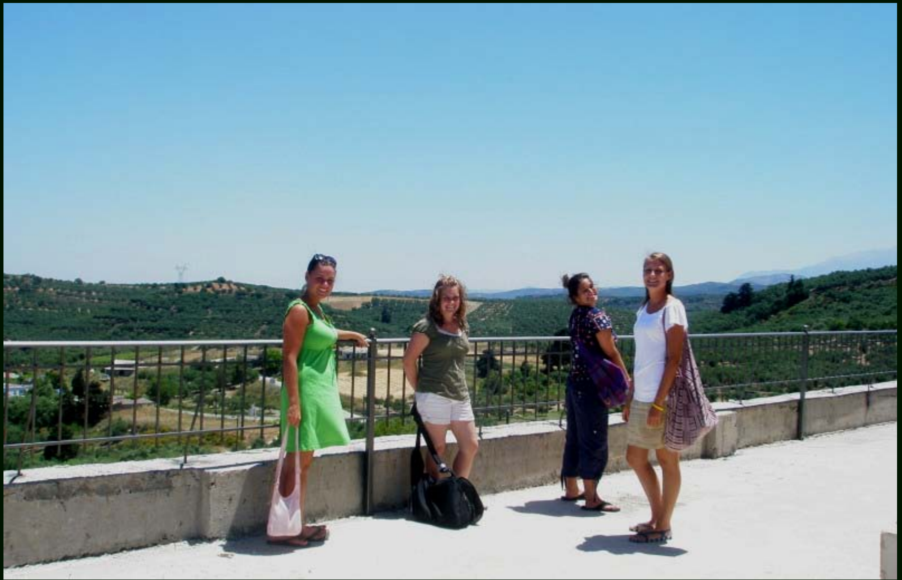
Biolea Organic Olive Farm and Factory