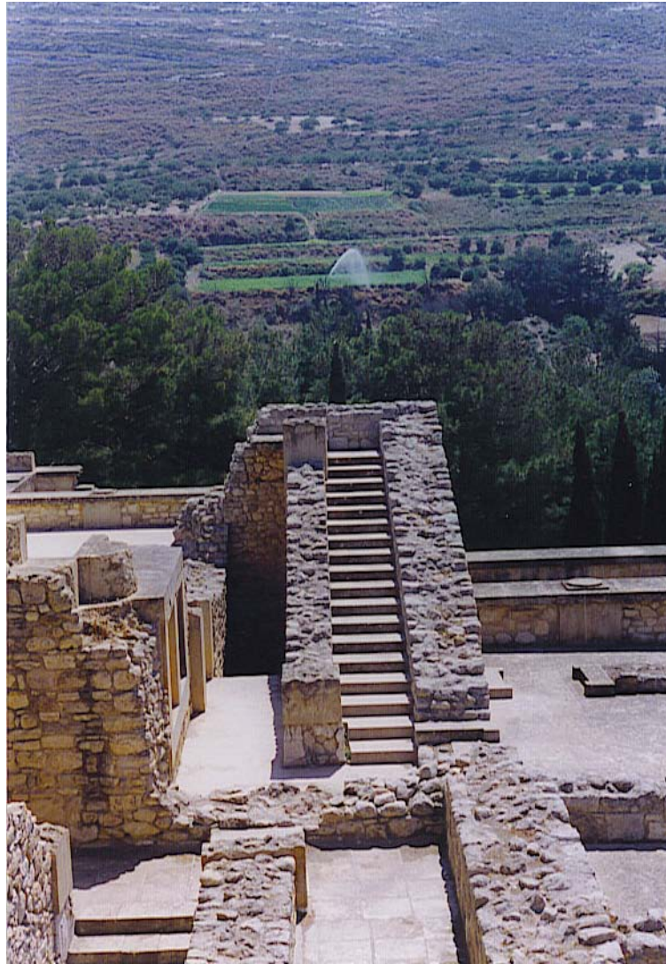
The Minoan Palace at Knossos. Note that agricultural production continues beyond the Palace walls.