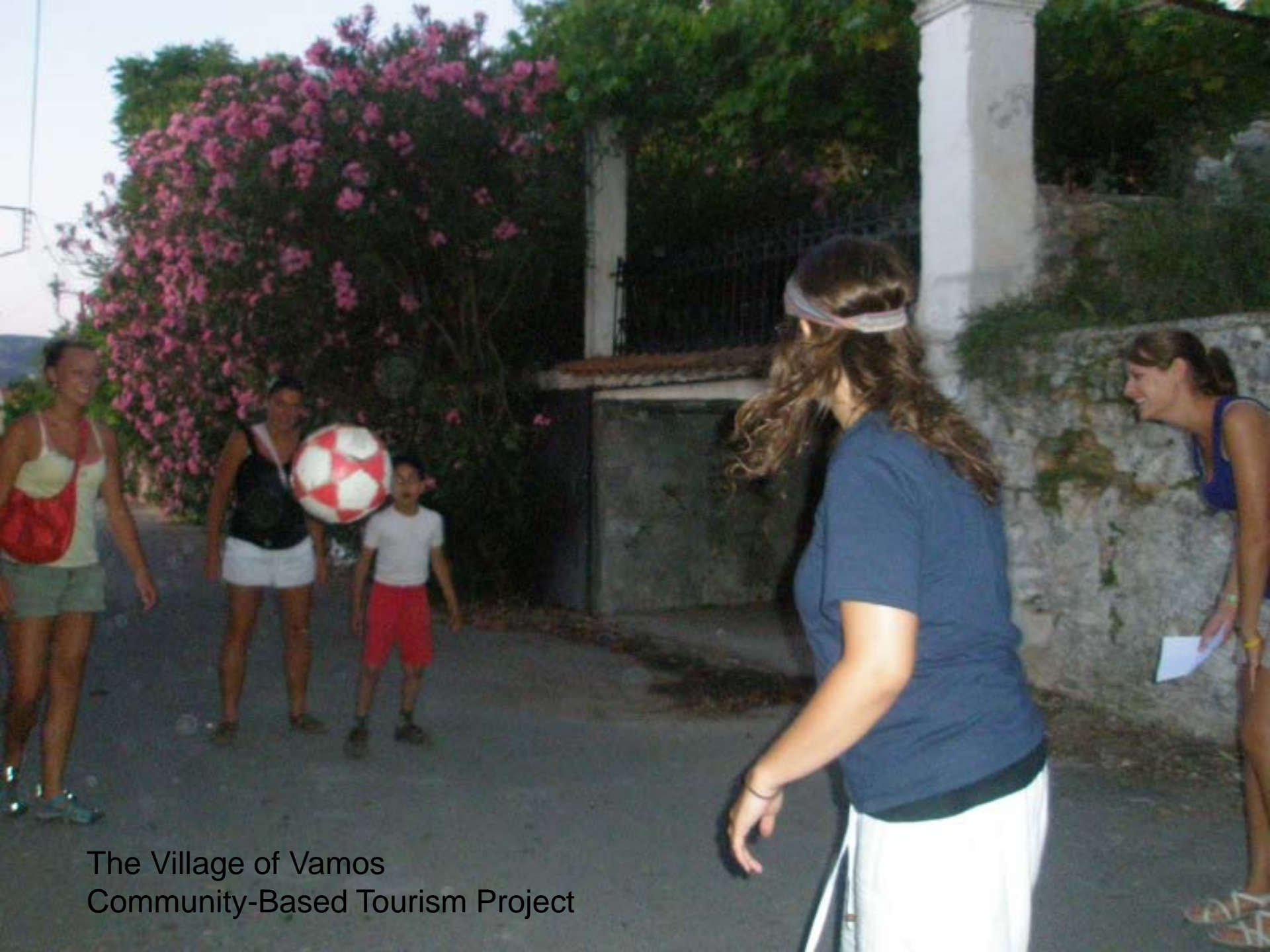
The Village of Vamos Community-Based Tourism Project